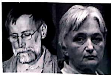
This couple raped & murdered 8 girls

Another major assumption is a criminal will look like a criminal. Actually many serial murderers, rapists or paedophiles look very decent and friendly.